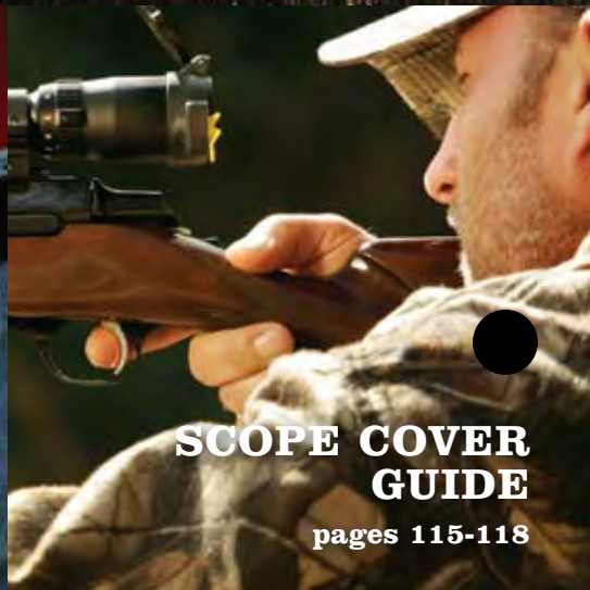
SCOPE COVER GUIDE pages 115-118