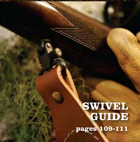
SWIVEL GUIDE pages 109-111